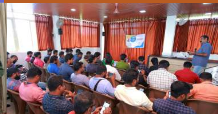
RPL assistment for Assistant Camerman (AKPA)