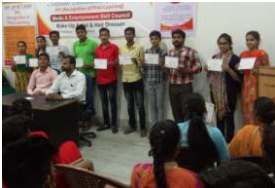
RPL Certificate Distribution ceremony of Salmani Khalifa Society

Rotomaker has worked on every major hollywood movie.