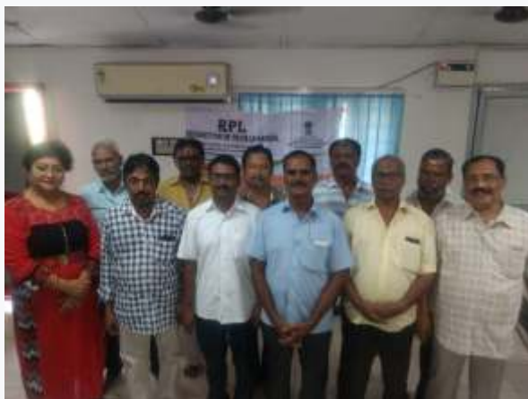
RPL Assessment for FEFSI, Chennai

Ans. RPL certification should be recognised by government bodies as a qualification for enrolment into opportunities with Public Media corporations or institutions, this would enable a truly skilled person to compete on par with a recognised Media school graduate.