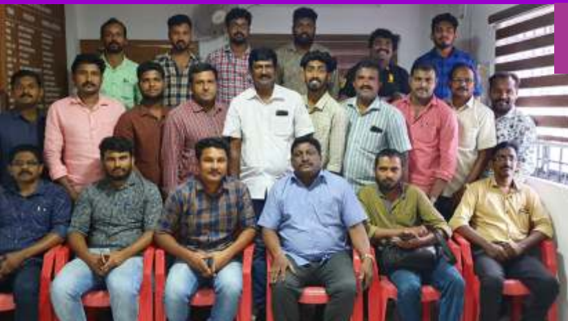
RPL assistment for Assistant Camerman (AKPA)