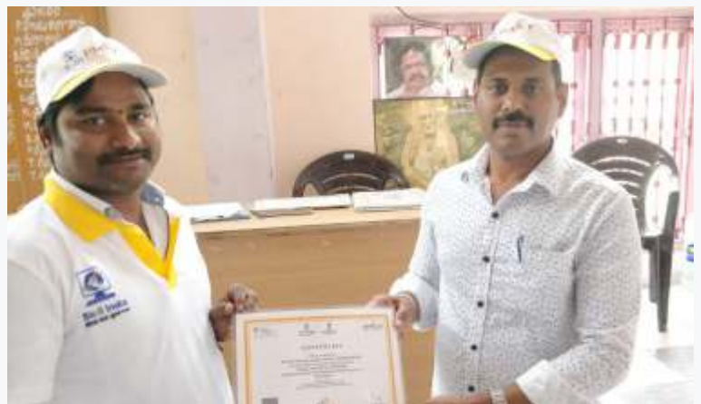
RPL Certificate distribution cere. Hair Stylist & Makeup Artist