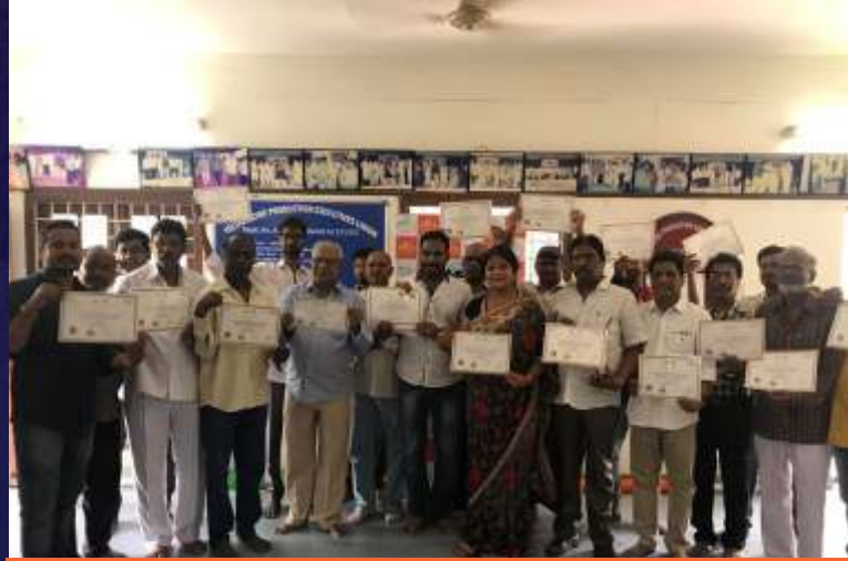
RPL certificate distribution ceremony